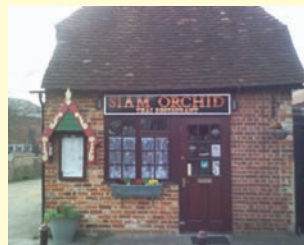
Outside Siam Orchid.

WE CATER FOR PARTIES AND SOCIAL FUNCTIONS (advance booking is advisable)